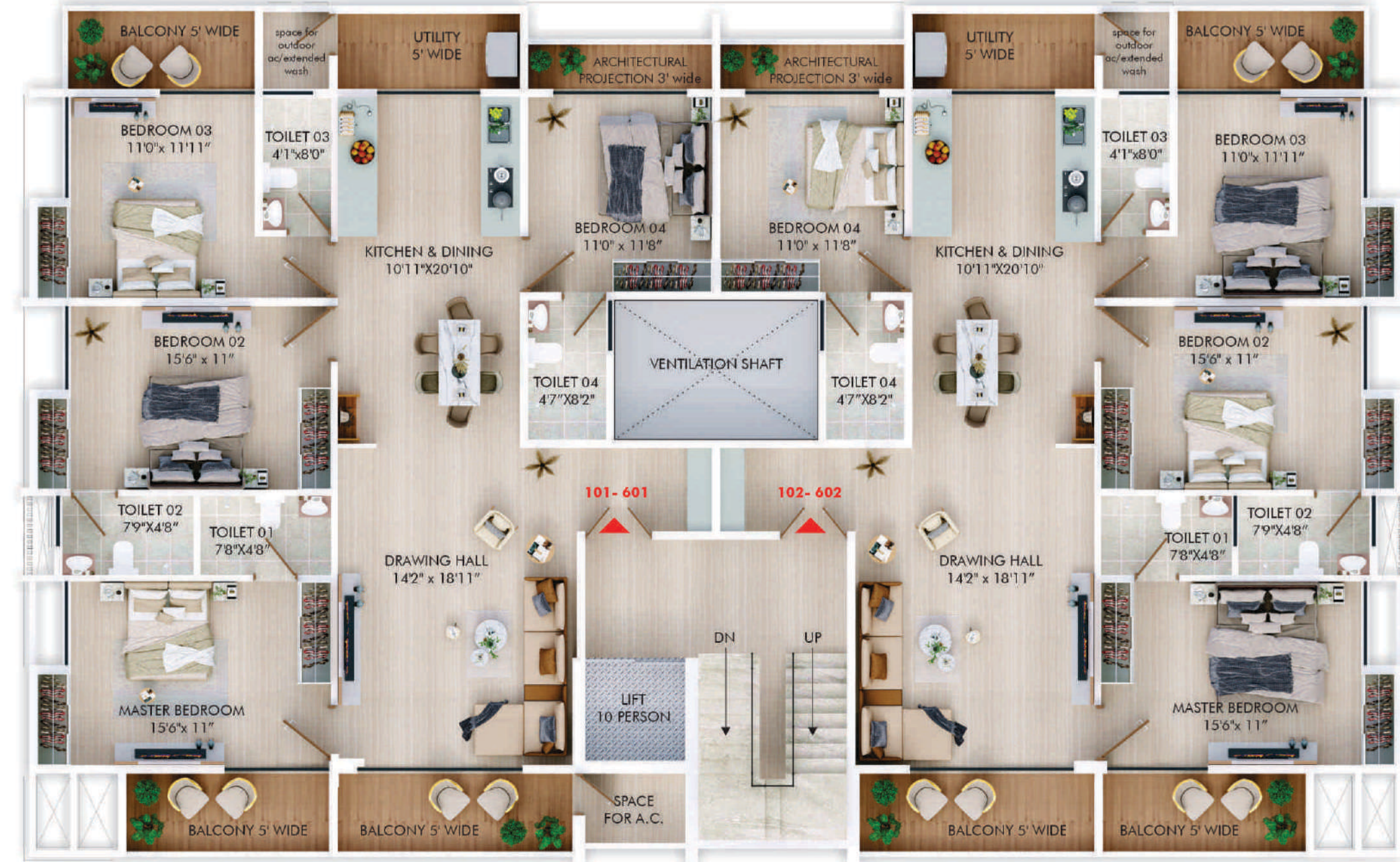
Typical Floor Plan 1st To 7th Floor